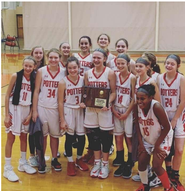
The 7th-grade girls won their regional game at Kingsley Junior High School.