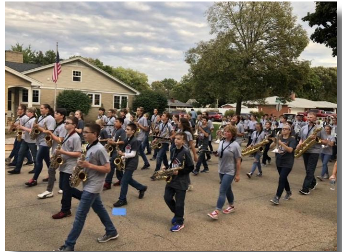
The MJHS Band marched at the Pumpkin Fest parade.

Now that you've heard both of their definitions of what a sport is, here is the dictionary definition: "an activity involving physical exertion and skill in which an individual or team competes against another or others for entertainment." What do you think? Is or isn't band a sport? What other activities can you think of might be questioned as a sport?